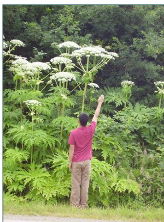
Giant Hogweed.

Giant Hogweed ( Heracleum mantegazzianum ) looks like a wild carrot on steroids. Its flowering stems can reach 5 m (16') high and 10 cm (4") in diameter. At the top is a compound umbel of white flowers that can be up to 120 cm (4') across. It has a flat bottom and gently rounded top . Stems are hollow, except at the nodes, and have conspicuous reddish-purple flecks throughout. Lower stems often have sharp-pointed bumps . In the first year, the plant produces a rosette of compound