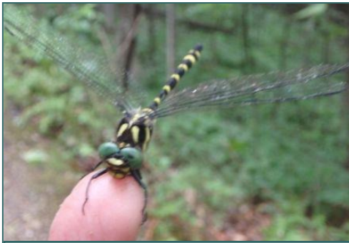
Figure 1: The Tiger Spiketail Dragonfly discovered in July 2014.

"We had finished our day in the field and were walking up the hill to our cars when we stumbled upon it", says Elizabeth Milne, a Biologist at Natural Resource Solutions Inc. "It was sitting perfectly still on