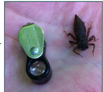
Figure 2: Delta-spotted Spiketail Dragonfly Nymph.

Huron County is home to some very healthy and biodiverse ecosystems. What will you discover?